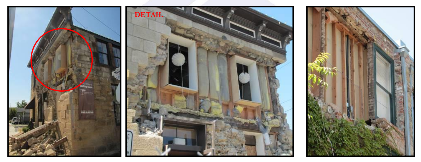
Damaged 1875-vintage stone masonry building in Napa. Note wall anchorage (through bolts with steel plates) in the close-up photo

Low-rise unreinforced masonry (URM) structures typically consist of brick or stone bearing walls and an interior wood frame. These pre-1930s structures are known to be vulnerable to earthquake damage, with safety implications. Typical weaknesses include: brittle wall construction, lack of structural connections between walls and interior framing, weak mortar, slender walls, extensive storefront openings (weak story), and heavy parapets (walls extending above roofline). Seismic retrofits typically tend to focus on occupant safety or preventing collapse. In 2006, the City of Napa passed an ordinance requiring retrofits of its 44 URM structures, though reportedly not all of these were in compliance at the time of the South Napa earthquake. We observed structural damage to both retrofitted and unretrofitted URMs, as shown below. URM structures are common in earthquake-prone areas such as western Oregon and Washington states, where seismic upgrades are typically voluntary, unless a change in use or a major renovation is proposed. The recent series of earthquakes that impacted Christchurch, New Zealand, has demonstrated that such "passive" upgrade policy may not be adequate in preserving communities with URM building stock. Landmark URM structures require retrofits beyond life-safety. Implementation of structural upgrades for URM buildings may require financial incentives.