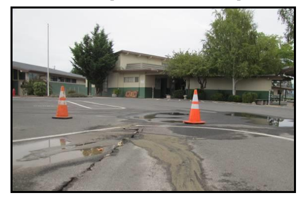
Ground rupture in an elementary school parking lot south of Napa resulted in fracture of underground water piping.