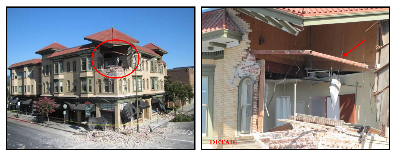
This three-story structure includes an unreinforced masonry façade, a portion of which collapsed onto the sidewalk below. The close-up photo shows remaining wall anchorage connections below the roofline.

The city of Napa (with a population of about 80,000) is located approximately 10 kilometers north of the earthquake epicenter. The region is home to over 500 wineries and attracts three million visitors annually. Napa County annually contributes over $25 billion to California's economy. Ground shaking affected historically significant buildings, residential structures, government facilities, critical utility operations (water distribution and telecommunications), as well as wine storage sites. The recorded horizontal peak ground accelerations near the epicenter approached values used for seismic design of modern structures. The region was recently affected by earthquakes in 1989 and 2000. Proactive structural and bridge upgrades lessened the impacts of this earthquake. However, significant damage was observed to unretrofitted and some retrofitted unreinforced masonry structures, as shown below.