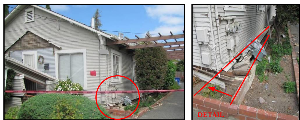
Residential wood-framed structures that predate modern seismic design consideration can shift from their foundations when short wood-framed walls are present surrounding the crawl space below the main floor. These common failures can lead to a fire-following-earthquake hazard from severed natural gas piping and nearby electrical components. Correcting this condition involves installation of plywood sheathing with floor and foundation connections.