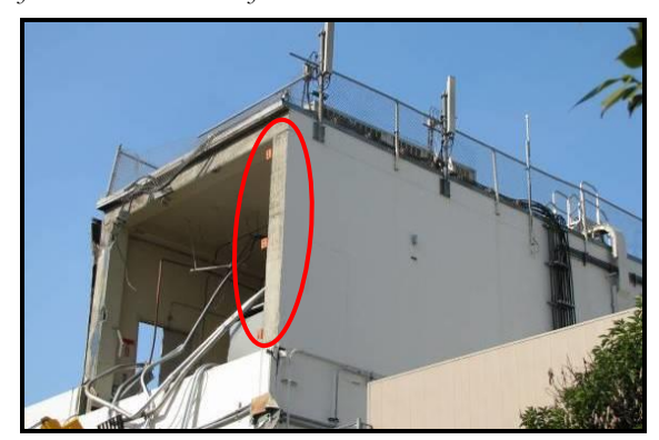
Precast concrete wall panel connections failure at a local telecom hub damaged HVAC system at this critical facility.