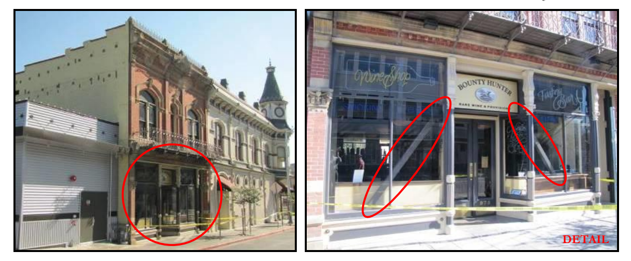
Retrofitted URM building that survived the earthquake. Upgrades included wall anchors and a steel braced frame at storefront.